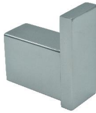
AI1418C Bright finish