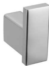
AI1418CS Satin finish