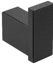
AI1418B Black finish