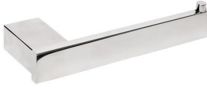
AI1421C Bright finish