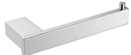
AI1421CS Satin finish