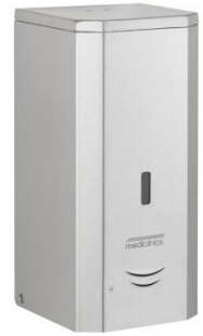
DJF0038ACS Satin finish