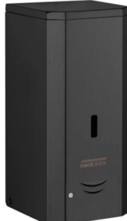
DJF0038AB Matte black epoxy finish