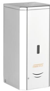
DJF0038AC Bright finish