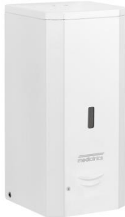
DJF0038A White epoxy finish