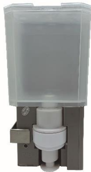
DJSM0039A Satin finish body