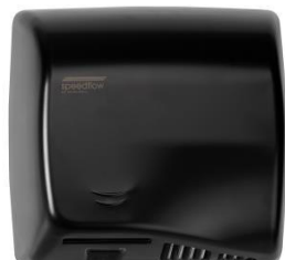
M17AB/M17AB-I Black finish