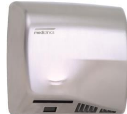
M17ACS/M17ACS-I Satin finish