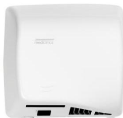
M17A/M17A-I White finish