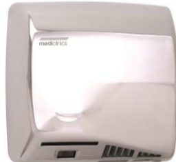
M17AC/M17AC-I Bright finish