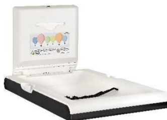
CP0016VCSB Polypropylene /Stainless steel Matte black finish