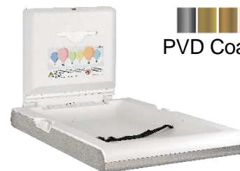
CP0016VCS Polypropylene /Stainless steel Satin finish