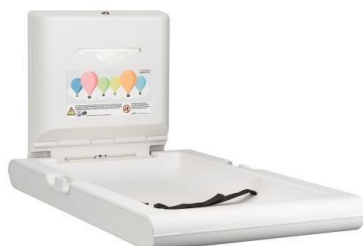
CP0016V Polypropylene White finish