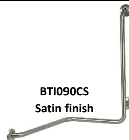
BTI090CS Satin finish