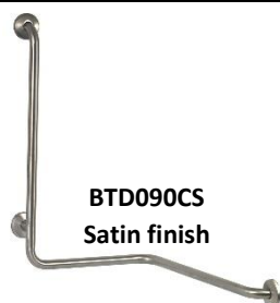
BTD090CS Satin finish